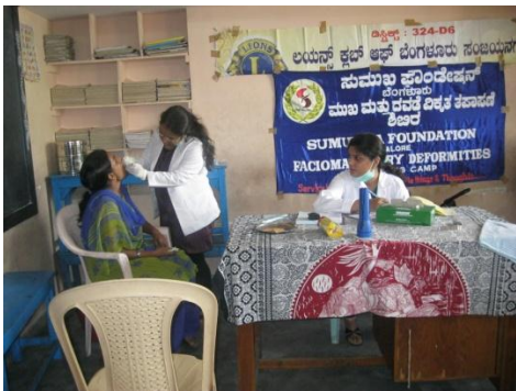
Health Camp conducted by Sumukh Foundation, with the support of Accenture