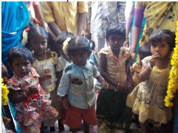
The children of the ELC programme

thereby improving the quality of education in the overall academic system. Group activities have improved the spirit of sharing among the children, leading to positive change in behavior and temperament.