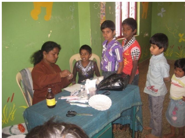
Children during a health camp

Day, and Teachers' Day, the staff went on an exposure trip to Yercaud with the children.