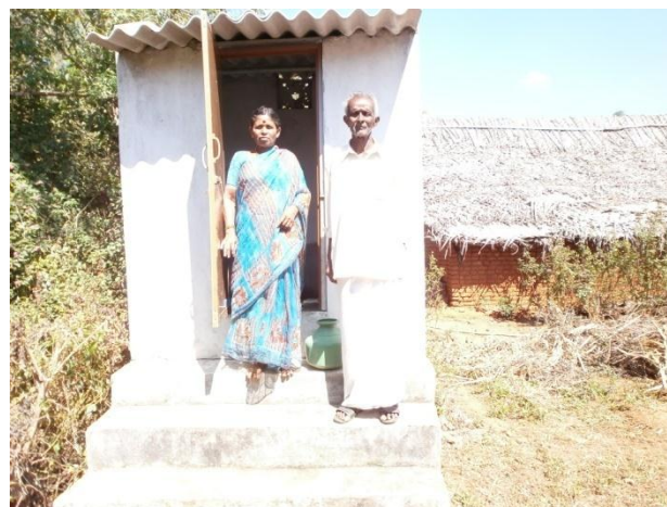
A beneficiary family of the eco-san toilet in Banawasi.