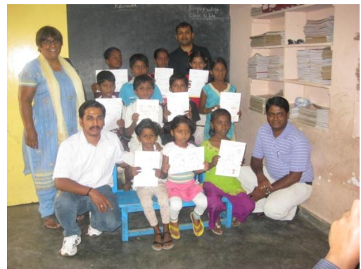
Students with Accenture Volunteers after a drawing competition.