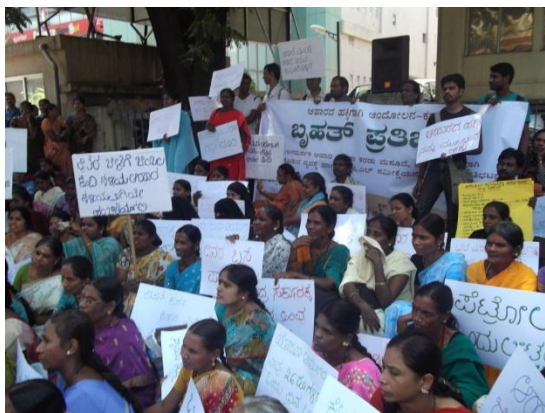
Public participating in state level protest against Government's decision to give money instead of ration in Bangalore